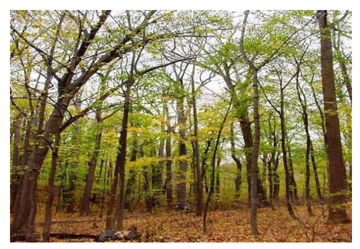
Red Springs Woods - New York

As we grow older- we can forget-a child's anticipation- of the spring – We are all so busy- with things- with the business of life- that has such little value.